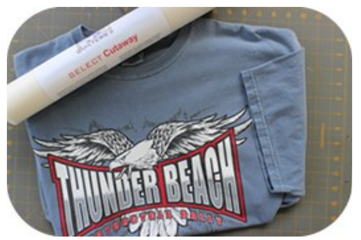
A great use for Select Cutaway is to stabilize knit or T-Shirt fabrics for your quilt blocks – follow these easy steps for getting your knit in control for quilting!