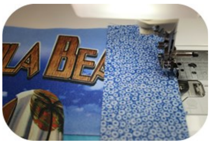
6. Add unique fabric strips to the outside to accent or frame the decal of the T-Shirt - *Tip - Use a wide and plain or soft colored fabric for the entire quilts sashing so you can add lettering, patches, decals and embellishment to commemorate the events from the decals used in the actual blocks!