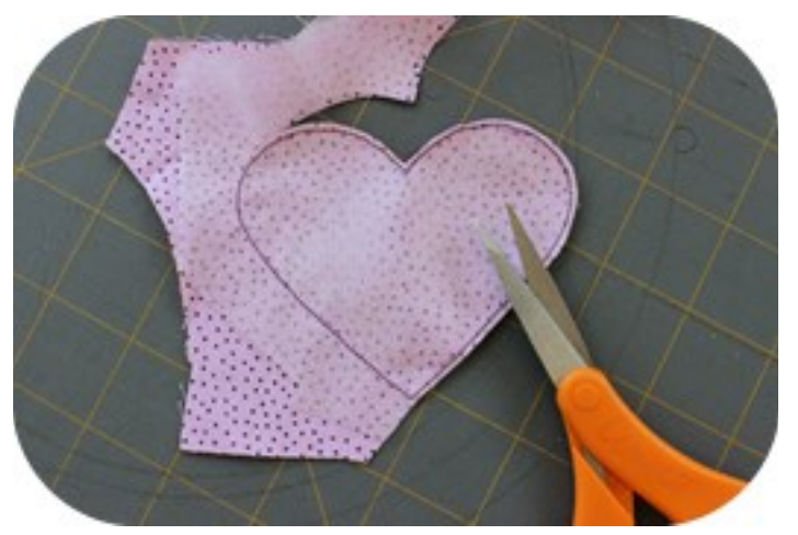
5. Once stitching is complete - trim excess fabric along the outside edge to within 1/8".

6. Cut a pocket in the stabilizer and turn – trim as much of the stabilizer as you like but leave at least ½" of the stabilizer to within stitching line.