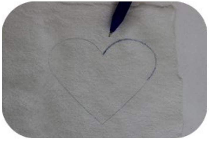
1. Trace or draw the applique image on to the fusible side of Select Cutaway.

Use Select Cutaway for creating a heat sealed edge on your turned edge applique pieces. The result is a durable applique piece that can be stitched into place with hand or machine stitching with no fear of the edge peeking out! Follow these easy steps for this exciting applique technique: