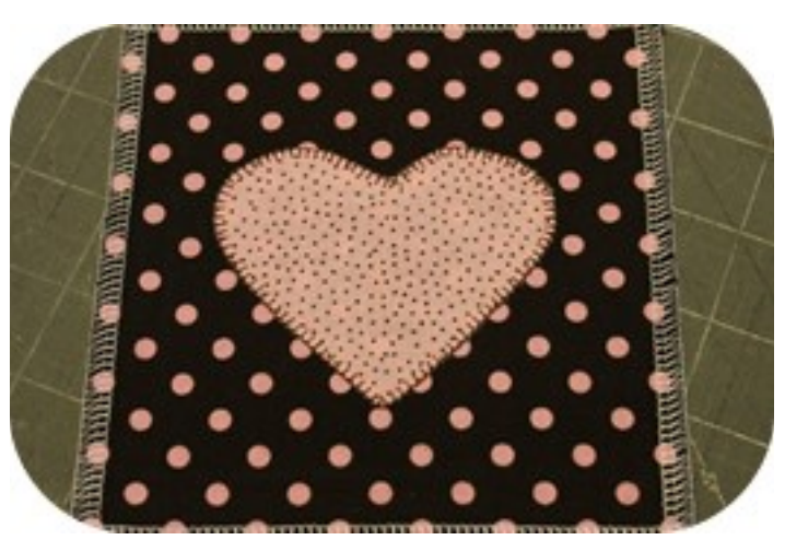
8. Applique into place on your quilt block or project of choice! *Tip – Select Appli-Web is ideal for securing the applique while you stitch!