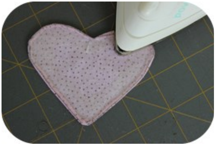
7. Using a medium temperature on your iron, press all the way around to seal the edge with the stabilizer

6. Cut a pocket in the stabilizer and turn – trim as much of the stabilizer as you like but leave at least ½" of the stabilizer to within stitching line.