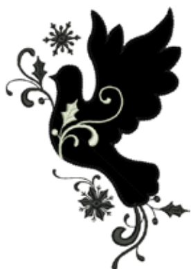
OC07001 Dove Appliqué 4.69 X 6.78 in. 119.13 X 172.21 mm 7,867 St. L

Note: Some designs in this collection may have been created using unique special stitches and/or techniques. To preserve design integrity when rescaling or rotating designs in your software, always rescale or rotate designs using the handles directly on-screen.