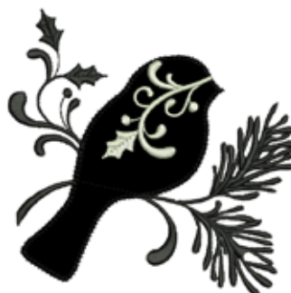
OC07003 Chickadee Appliqué 4.86 X 4.85 in. 123.44 X 123.19 mm 10,064 St.