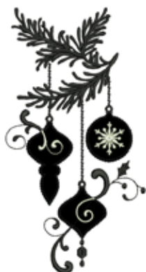
OC07009 Ornaments Appliqué 4.06 X 7.79 in. 103.12 X 197.87 mm 15,023 St. L