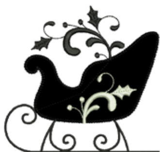
OC07005 Sleigh Appliqué 4.85 X 4.62 in. 123.19 X 117.35 mm 6,548 St.