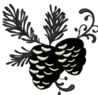
OC07006 Pinecones Appliqué 4.84 X 4.59 in. 122.94 X 116.59 mm 11,906 St.