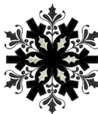
OC07008 Snowflake Appliqué 4.20 X 4.85 in. 106.68 X 123.19 mm 10,218 St.