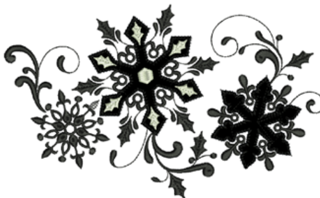
OC07015 Snowflakes Jumbo Appliqué 5.13 X 8.45 in. 130.30 X 214.63 mm 19,957 St. L