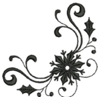
OC07013 Snowflake Corner 3.66 X 3.67 in. 92.96 X 93.22 mm 6,213 St.

Note: Some designs in this collection may have been created using unique special stitches and/or techniques. To preserve design integrity when rescaling or rotating designs in your software, always rescale or rotate designs using the handles directly on-screen.