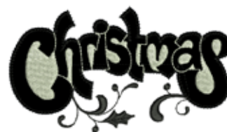
OC07012 Christmas Appliqué 3.05 X 5.40 in. 77.47 X 137.16 mm 6,554 St. L

⌘ Design contains a loose fill. ⚙ Some white areas shown are not stitched.