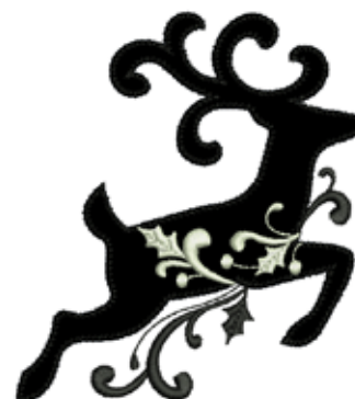
OC07004 Reindeer Appliqué 4.32 X 4.88 in. 109.73 X 123.95 mm 4,720 St.