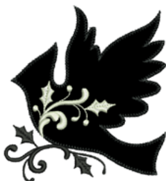
OC07002 Cardinal Appliqué 4.45 X 4.85 in. 113.03 X 123.19 mm 5,392 St.