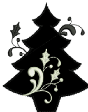
OC07007 Christmas Tree Appliqué 3.88 X 4.92 in. 98.55 X 124.97 mm 4,084 St.