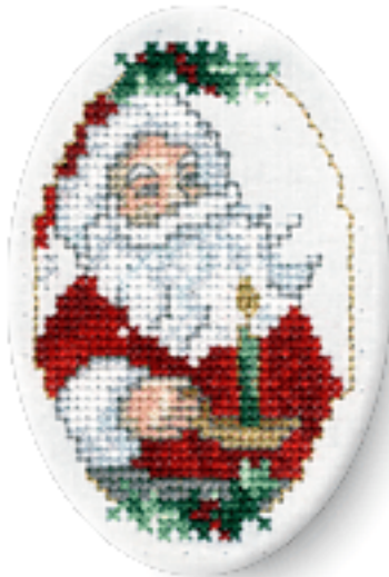
Santa & Candle

16 Ct 1.83" x 2.89" 14 Ct 2.20" x 3.47" 11 Ct 2.90" x 4.26"