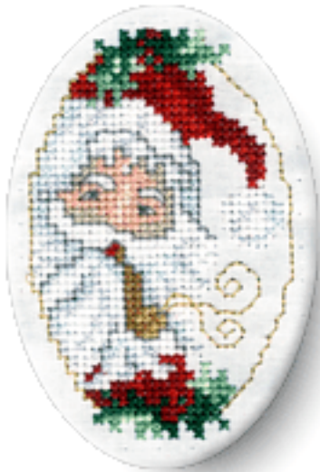
Santa & Pipe

16 Ct 1.83" x 2.89" 14 Ct 2.20" x 3.47" 11 Ct 2.90" x 4.26"