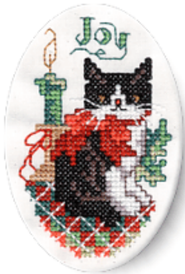
Black & White Cat